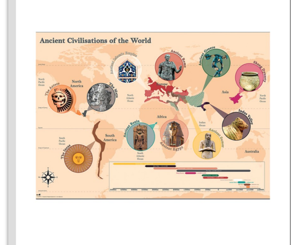
Year 3 have been learning about Ancient civilisations in history and researching where in the world they began.