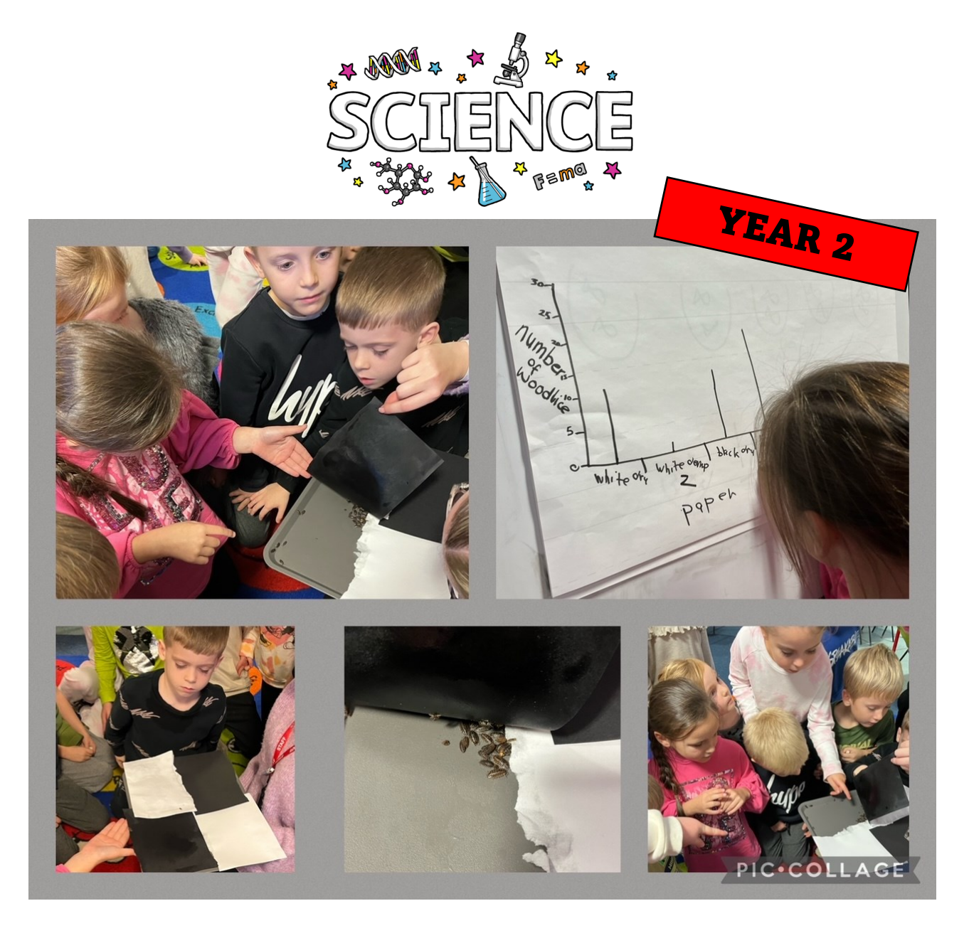
In science year 2 did an experiment to discover what the favourite habitat would be for wood lice.